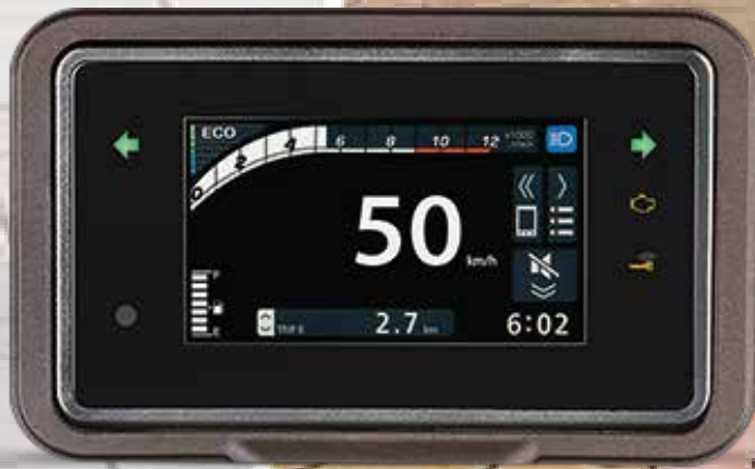
All New ACTIVA 125